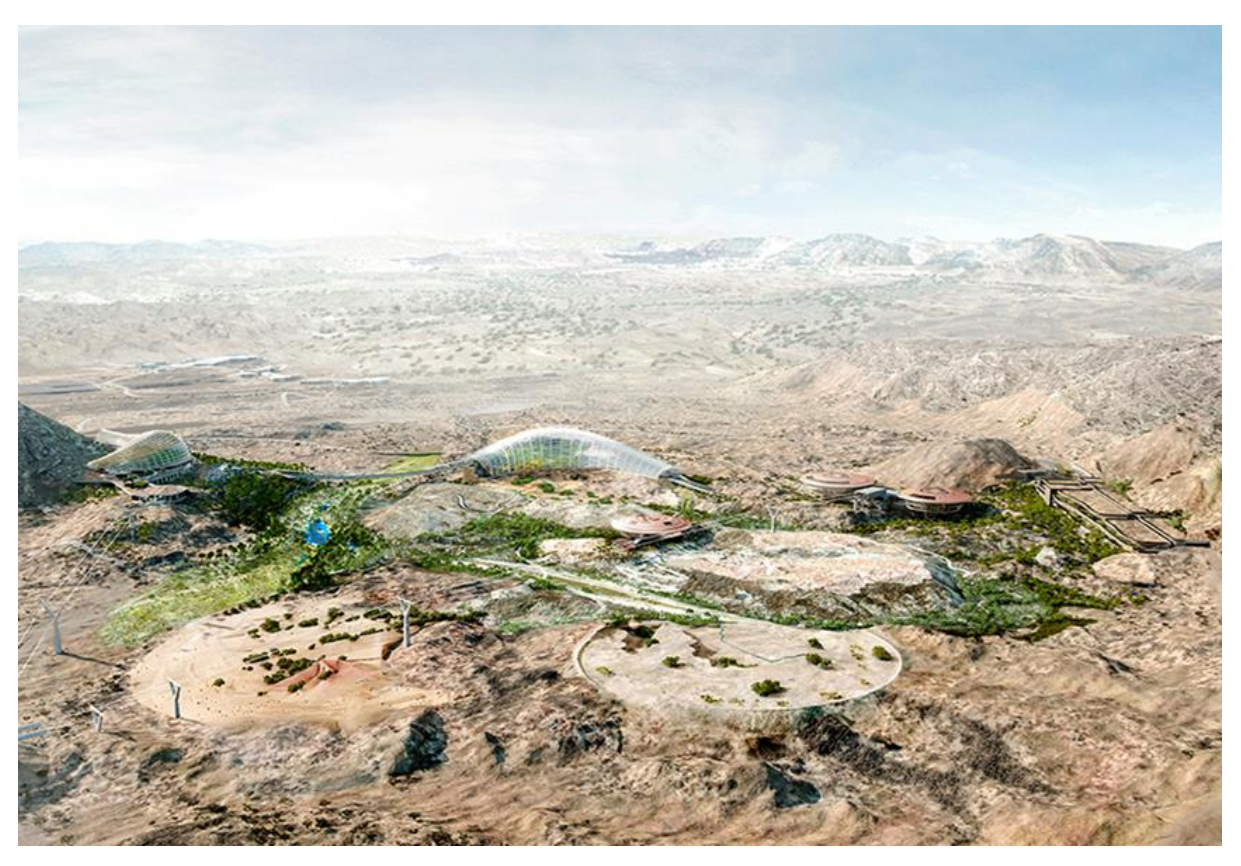
Figure 1. Overview of Oman Botanic Gardens.

The Southern Biome will showcase plant species and habitats prevalent in the Dhofar region of the Sultanate. There will also be a visitor centre with interpretive exhibits, cable car, café and gift shop.